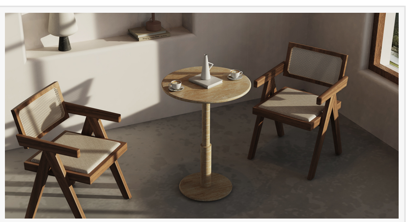
OIXDESIGN Travertine Dining Table: A refined, minimalist design crafted from natural travertine stone, perfect for intimate gatherings and modern interiors.

OIXDESIGN has caused a revolution in the marble furniture world with their new patented modular design. This forward-thinking approach has an impact on quick, tool-free assembly making their high-end tables both useful and easy to get. The modular design removes the need to use tools allowing people to customize and move these top-quality furnishings with ease.