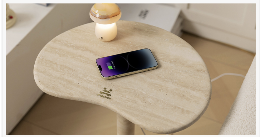
OIXDESIGN PeaPod Travertine Side Table: A blend of elegance and technology featuring built-in wireless charging and a smooth, natural stone finish for modern living.

100% solid natural marble: Ensuring durability and a touch of opulence in any space Modular, tool-free assembly: Allowing for easy setup and relocation, a first in marble furniture