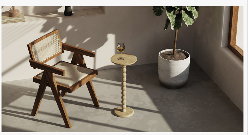
OIXDESIGN Travertine Cocktail Table: A sleek and elegant companion for any space, featuring a natural travertine stone finish that brings sophistication to modern living.