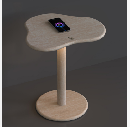
OIXDESIGN CloudDream Side Table: A luxurious blend of Italian Carrara marble and Classico Travertine, featuring integrated wireless charging and touchcontrolled night light.