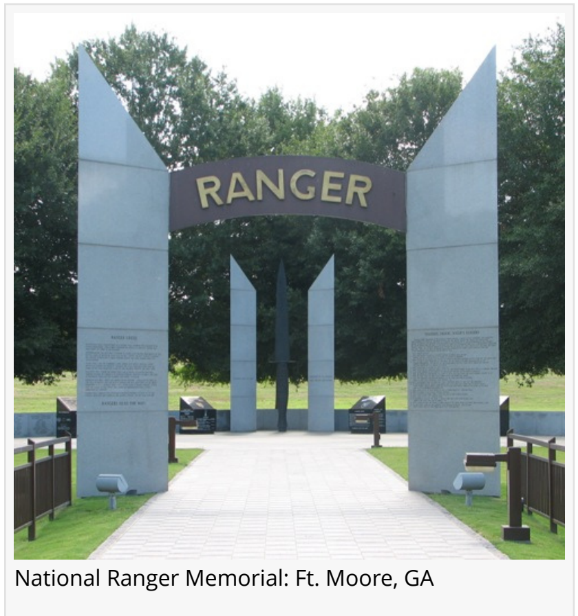
National Ranger Memorial: Ft. Moore, GA

This press release can be viewed online at: https://www.einpresswire.com/article/747806067