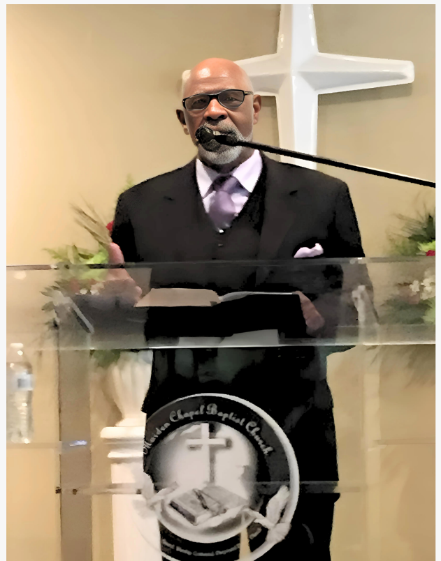
Transforming trials into testimonies of hope.