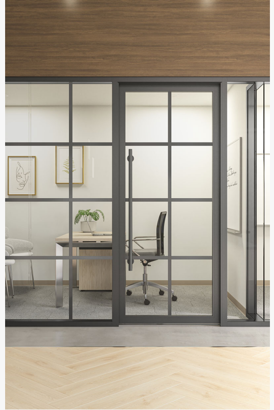
Muntins are one of the many ways LiteSpace can be customized in your office or other space.

style to your specific design vision. Additionally, a wide variety of finish options, including custom colors and wood grain (without the downsides of real wood) are available to ensure that the finished result aligns perfectly with your space.