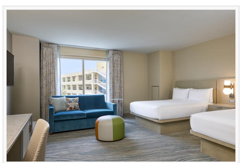
Renaissance ClubSport in Aliso Viejo

From the ground up, Renaissance ClubSport completed its latest phase of upgrades to its sprawling property, which includes a 4-star hotel and 100,000-square-foot fitness resort that was fully updated in 2022. Paying