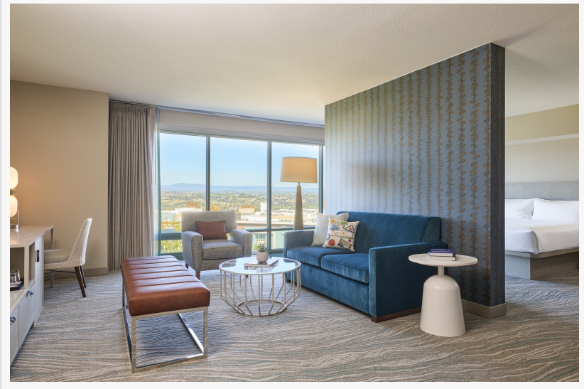
An executive suite at Renaissance ClubSport

homage to the beauty of the Laguna Beach coast, which is only minutes away, each room and suite has been redesigned with a coastal feel. All rooms were given a unique, modern approach to their refreshed decor, bathroom fixtures, wallpaper, curtains, and bespoke furniture.