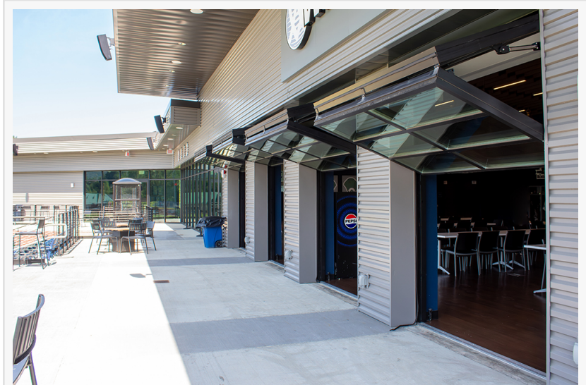
Renlita bi-fold doors by ModernfoldStyles improve fan experience and space flexibility.

ModernfoldStyles, Inc. is a leading provider of innovative space management solutions. Our dedication to cutting-edge design and functionality drives us to deliver exceptional products that transform spaces, including those in stadiums, educational facilities, and commercial properties. If you're interested in exploring these products for your next project, ModernfoldStyles has