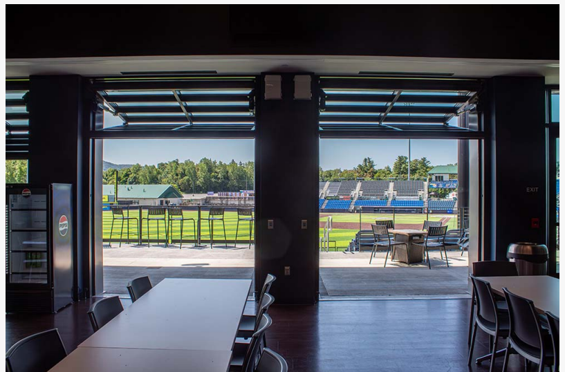
Stylish and efficient: Renlita bi-fold doors redefine Heritage Financial Park's architecture.