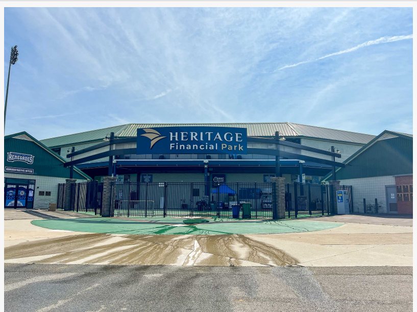
ModernfoldStyles elevates Heritage Financial Park with Renlita bi-fold door installations.

As part of the stadium's ongoing renovation following its purchase by Heritage Financial Credit Union in 2023, ModernfoldStyles partnered with Piazza Brothers Inc. to install Renlita's advanced bi-fold doors to enhance the functionality and appeal of the newly designed left-field clubhouse, seating bowl, and restroom building. The project was expertly designed by the