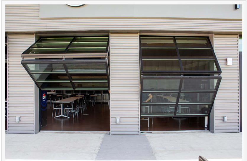
Heritage Financial Park's left-field clubhouse with stylish, versatile Renlita bi-fold doors.

This press release can be viewed online at: https://www.einpresswire.com/article/747912948