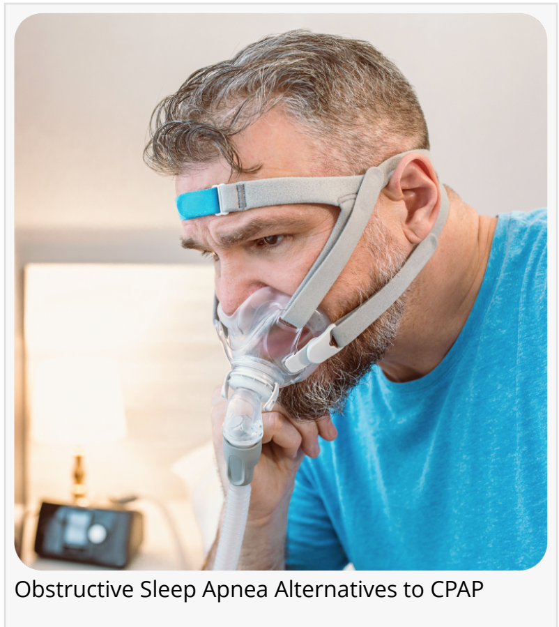
Obstructive Sleep Apnea Alternatives to CPAP

LOS ANGELES, CA, UNITED STATES, October 1, 2024 /EINPresswire.com/ -- Dentulu, the leading Teledentistry platform, today announced the launch of its nationwide sleep apnea program aimed at increasing accessibility to sleep apnea screening, diagnosis, and treatment. In collaboration with a nationwide network of sleep physicians and sleep apnea dentists across the country, Dentulu will offer at-home screening and diagnostic services, bringing critical care directly to patients' homes. All patients are required to have an in-person visit with a dentist and obtain a clearance form to complete the treatment process ensuring a symbiotic relationship with dental offices and DSOs while ensuring that standards of care are met and exceeded.