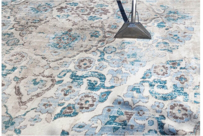
Area Rug Cleaning in Tarzana, CA

One of the key differentiators in JP Carpet Cleaning Expert Floor Care's approach to rug cleaning is its commitment to eco-friendly solutions. Traditional cleaning products can contain harmful