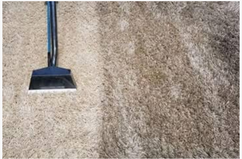
Steam cleaning an area rug, before and after