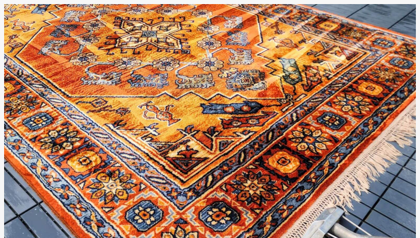
Tarzana Rug Cleaning

JP Carpet Cleaning Expert Floor Care, boasting over 20 years of industry experience, has fine-tuned its cleaning methods to meet the highest standards of service. The