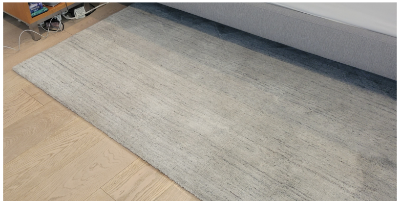
Rug cleaning granada hills