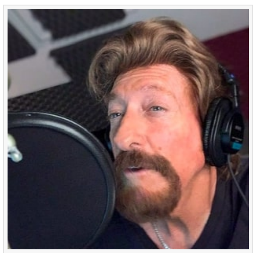
Hire Voice Over Actor

The voice-over artist plays a critical role in this process. A professional voice-over can significantly enhance a documentary by providing authority, emotional depth, and clarity.