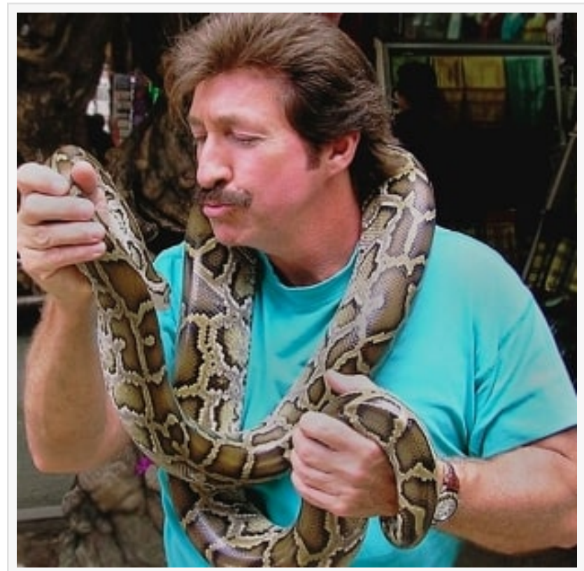
Voice Over Artist for Hire