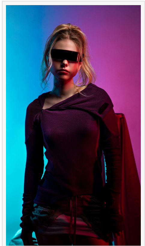
EKRUZER AND BEUTER TEAM UP CYBERPUNK FASHION

Are you a fashion designer? Reach out and connect with the EKRUZER team at Media@EKRUZER.com title your email "FASHION COLLABERATION"