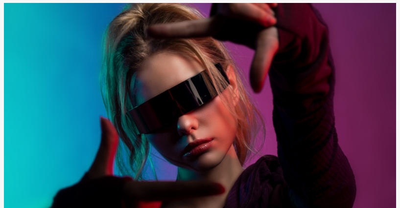
EKRUZER AND BEUTER TEAM UP CYBERPUNK FASHION

MELBOURNE, VICTORIA, AUSTRALIA, October 1, 2024 /EINPresswire.com/ -- In an electrifying resurgence, Cyberpunk fashion is set to redefine the style landscape, and EKRUZER is at the forefront of this movement. Teaming up with the innovative Vietnamese fashion brand Beuter , EKRUZER has unveiled a stunning Cyberpunk-themed photo shoot to celebrate the launch of their new website. This collaboration marks a significant step in EKRUZER's mission to bring the bold, dynamic aesthetics of Cyberpunk into the mainstream.