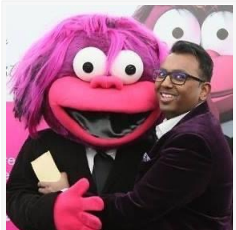
Transform Your Brand's Visibility With Our customisable Signage Solutions

Meet The Man Behind The Creative Approach Of Board Printing Solutions