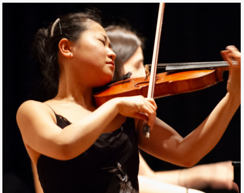
Bloomington School of Music's Free Faculty Concert Series