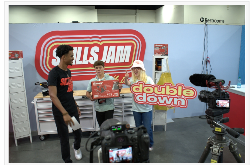
Skilled Careers Coalition helps inspire students to pursue skilled careers via @SKILLS JAM, a for youth, by youth entertainment platform on social media.

Students, counselors and parents surveyed shared their perceptions on skilled trades vs. college and military career paths as part of the SCC study which found financial security is the top motivator for youth when choosing a career path, with 76% agreeing that a career in the skilled trades can lead to owning a business and entrepreneurial success. Students surveyed were also drawn to other key aspects of a skilled trade career including job stability, less debt, high quality of life, and high-income potential.