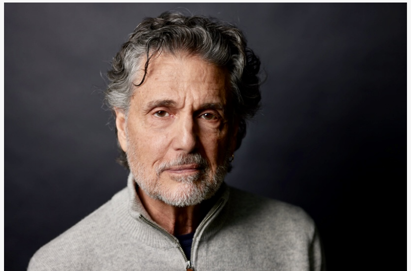
Chris Sarandon.

FAIRFIELD, CT, UNITED STATES, October 1, 2024 /EINPresswire.com/ -- Get ready to feed your mind and appetite as Academy Award-nominated actor Chris Sarandon returns with the much-anticipated Season 3 of his hit podcast, Cooking By Heart , which launches today. The season opener features the one and only Rosanna Arquette , kicking off a star-studded lineup of celebrity guests and unforgettable food memories.