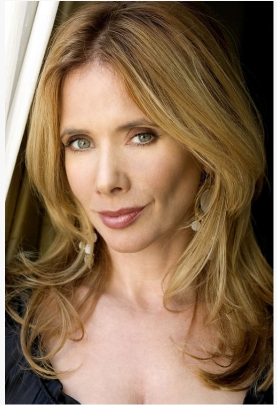
Rosanna Arquette.

Chris Sarandon's growing media profile continues to make headlines. Season 3 promises even more memorable moments, including celebrity guest appearances and the captivating chemistry between Chris and his guests. The highly-anticipated launch is expected to draw interest from food enthusiasts, pop culture fans, and media outlets