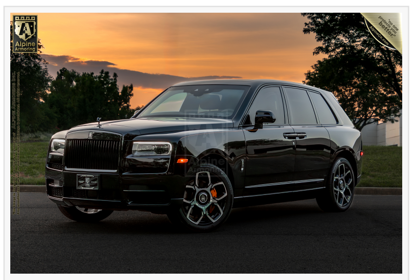
Indulge in the ultimate expression of luxury with the armored Rolls-Royce Cullinan.

CHANTILLY, VA, UNITED STATES, October 8, 2024 /EINPresswire.com/ -Known for setting the standard in luxury and sophistication, the RollsRoyce Cullinan now benefits from Alpine Armoring's cutting-edge ballistic protection, creating an unmatched blend of elegance and security. With Alpine's A9/B6+ level armoring, the Rolls-Royce Cullinan is fortified to