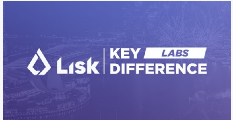
Lisk & KEY Difference Unveil their Pioneer Program