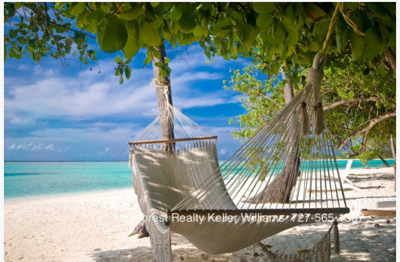
Frenchman's Caye Beach