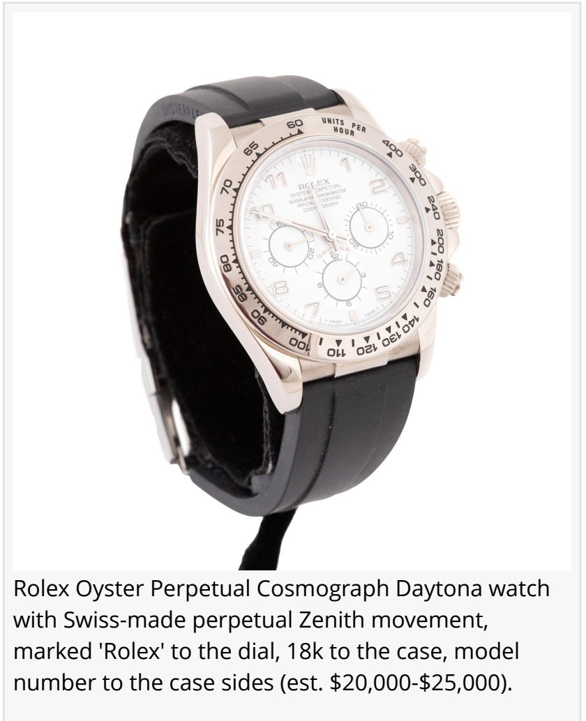
Rolex Oyster Perpetual Cosmograph Daytona watch with Swiss-made perpetual Zenith movement, marked 'Rolex' to the dial, 18k to the case, model number to the case sides (est. $20,000-$25,000).

A large Persian antique hand-woven Serapi rug from the early 20th century, having lovely floral and geometric designs and decorated in colors of red, blue, ivory and tan, apparently unsigned and measuring an impressive 12 feet 2 inches by 11 feet 9 inches, has an estimate of $4,000-$6,000.