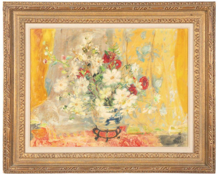
Circa 1972 oil on silk laid to Masonite board still-life by Lê Phổ (Vietnamese / French, 1907-2001), titled Les Dahlias Blancs (The White Dahlias), artist signed lower right (est. $30,000-$5,000).