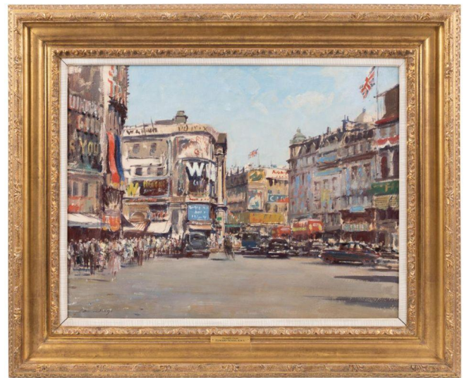
Mid-20th century oil on canvas street scene by Edward Brian Seago (U.K., 1910-1974), titled Piccadilly Circus, signed lower left, 20 ¼ inches by 26 ¼ inches (canvas) (est. $25,000-$35,000).