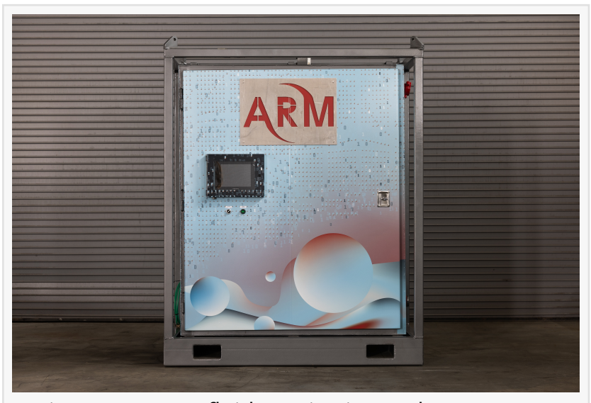
Aerion's new ARM fluid monitoring and management system

The ARM is designed specifically for monitoring and optimizing drilling fluids, ensuring that critical fluid parameters are known in real-time. The ARM captures and analyzes parameters including mud weight, oil and water ratios, viscosity, solids content, and temperature, using sensors specifically designed for the rugged conditions of drilling operations. The system's Al-driven analytics process incoming data in realtime, instantly identifying shifts in fluid properties that could disrupt performance. This immediate feedback loop allows operators to make precise adjustments, reducing risks and preventing costly downtime.