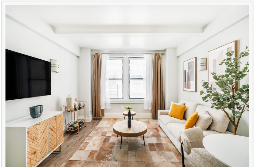
Urban Furnished Partners with Ernesto's

NEW YORK, NY, UNITED STATES, October 2, 2024 /EINPresswire.com/ -- Urban Furnished continues to raise the bar for tenant satisfaction with its latest partnership with Ernesto's , an authentic Basque-style restaurant in the Lower East Side. This collaboration, hot on the heels of Urban Furnished's recent exclusive deal with Select, exemplifies the company's commitment to enhancing tenant experiences both within and beyond their well-appointed accommodations.