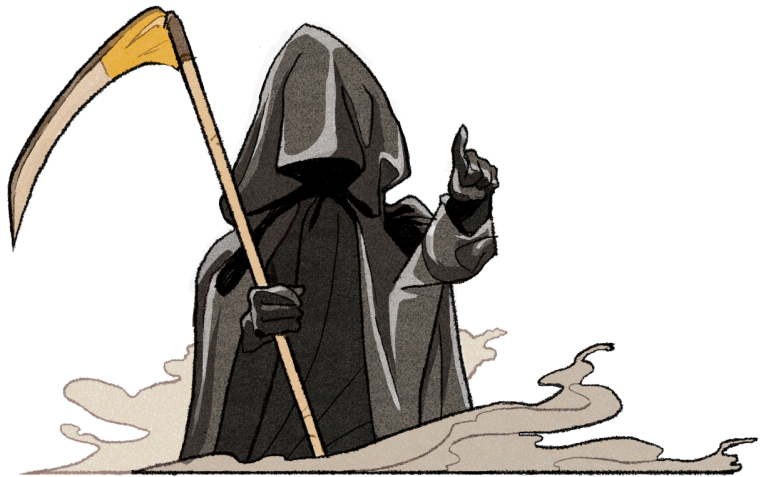
The Grim Reaper

This press release can be viewed online at: https://www.einpresswire.com/article/748409747