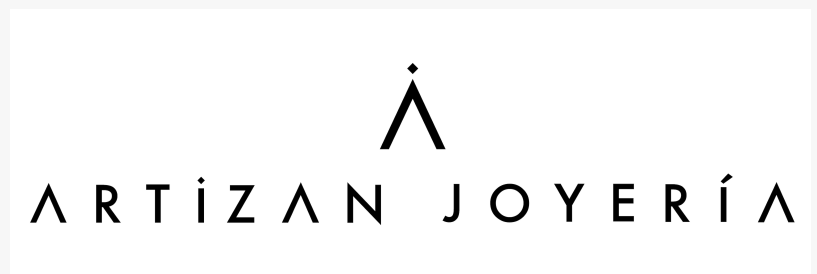
Artizan Joyeria Loco