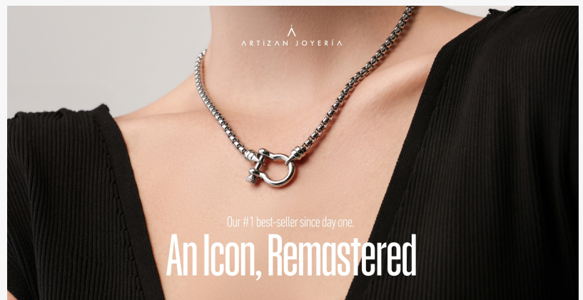
Herradura Signature Icon