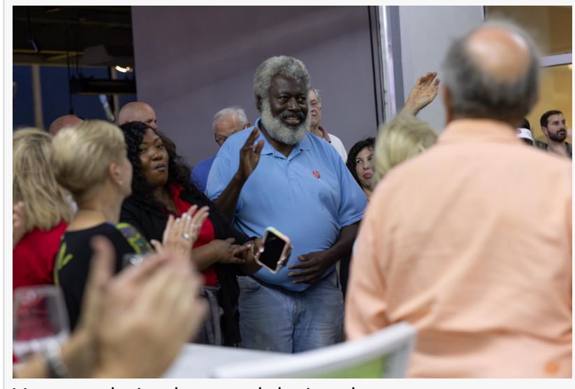
Veterans being honored during the event

The Center also provides innovative new programming through a "Respite Care" program which provides shelter to medically needy veterans and homeless individuals while their health concerns are being stabilized. Each