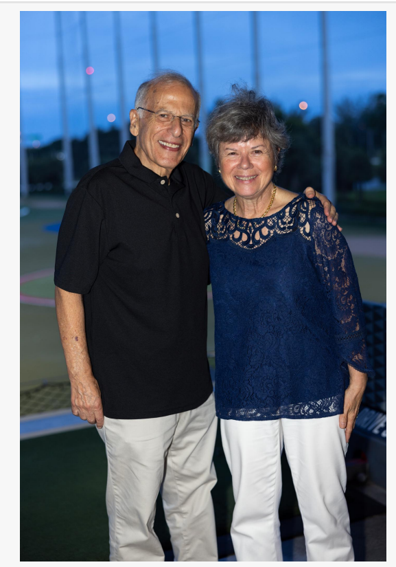
Title Sponsors of the Event

The fun-filled evening raised needed funding for The Salvation Army's