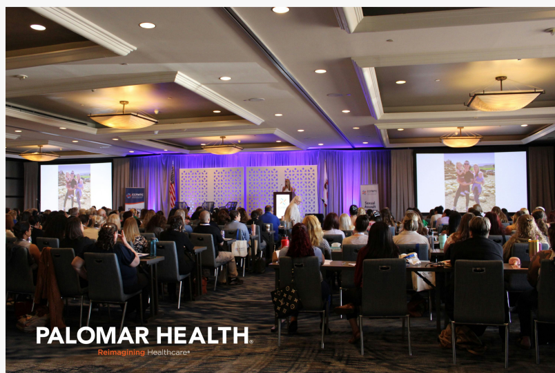
Palomar Health proudly hosted the 13th Annual Sexual Assault Response Team (SART) Summit