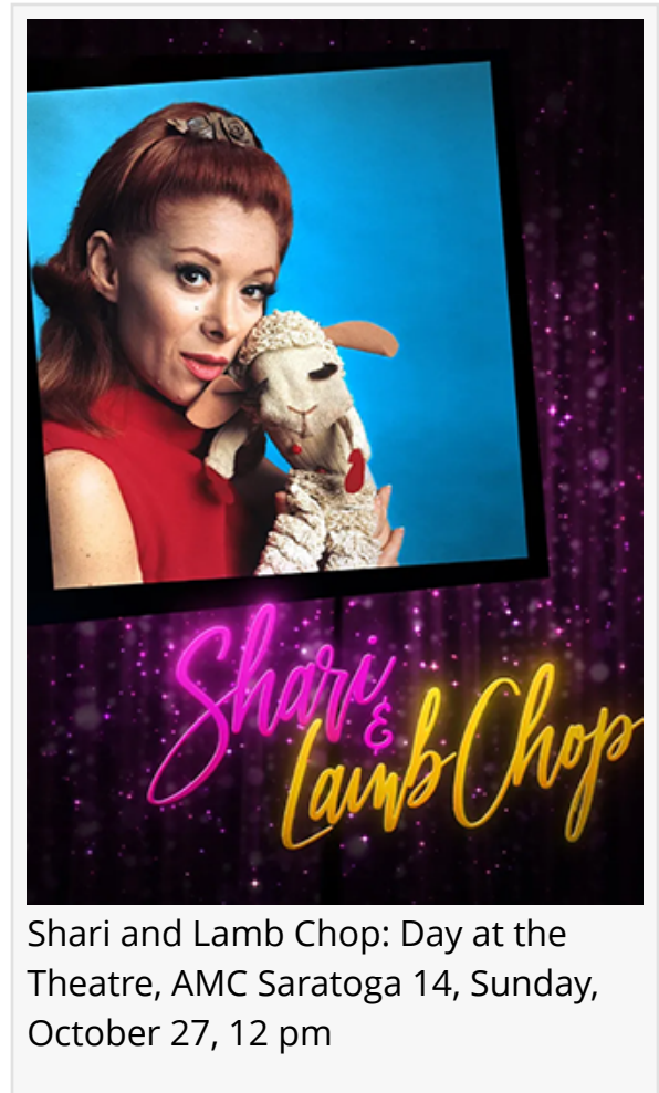
Shari and Lamb Chop: Day at the Theatre, AMC Saratoga 14, Sunday, October 27, 12 pm