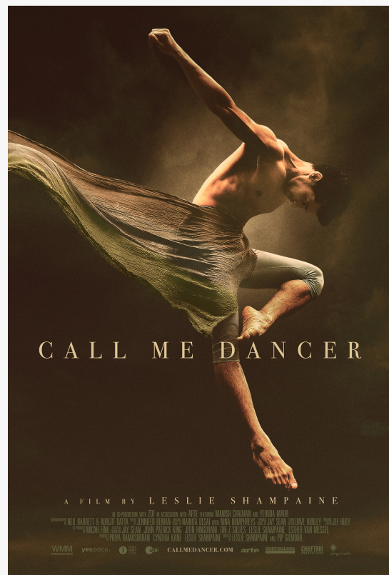
Award-Winner Call Me Dancer: Closing Night, November 10, 7 pm