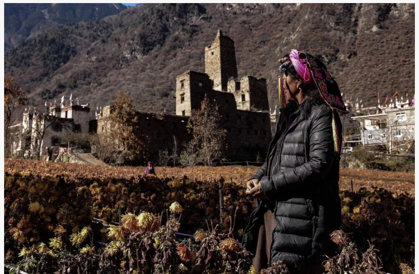
Movie Still of Mill at Badi