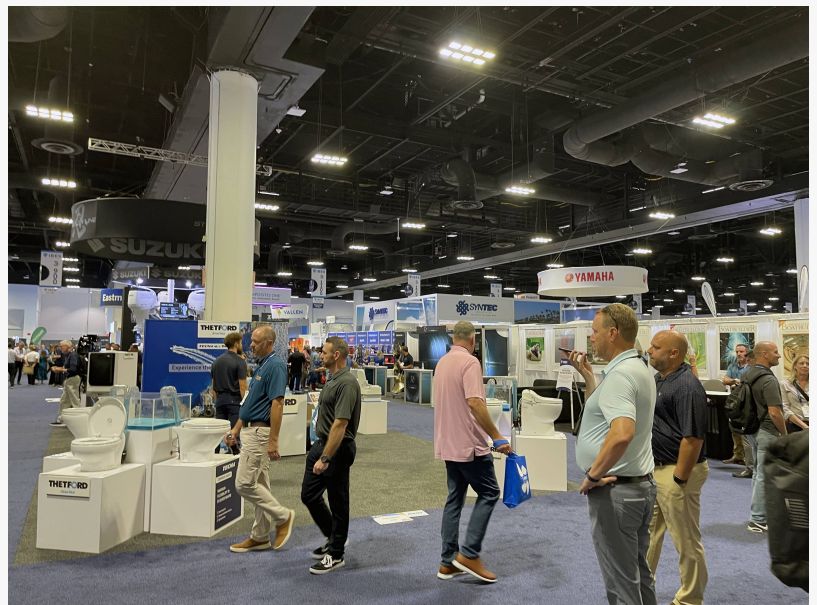
IBEX Show 2024 - Show Floor