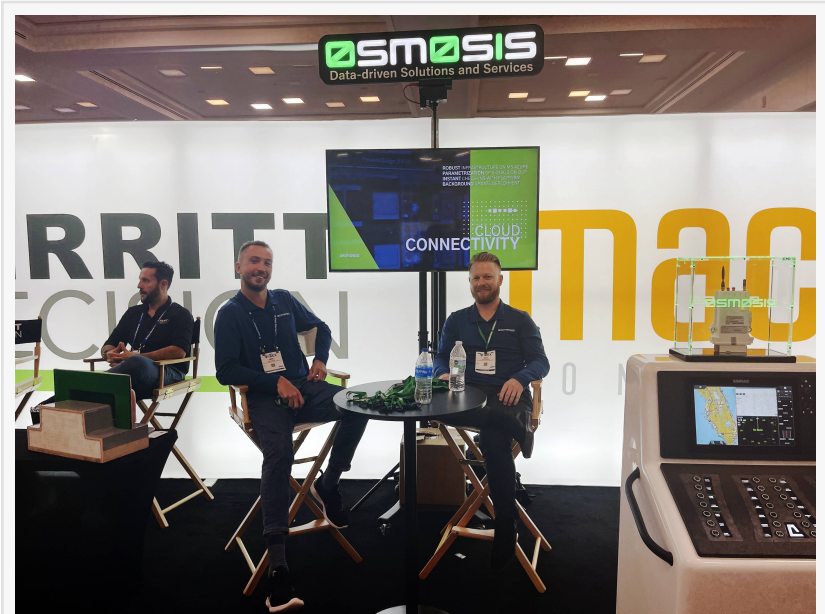
Osmosis Group at IBEX Show 2024

STW Technic’s partnership with Osmosis highlights its ongoing commitment to bring more than 20 years of experience in mobile machine technology to the marine market. STW Technic is known for providing state-of-the-art telematics , IoT hardware, and automation solutions for off-highway industries. Now, the company is bringing this expertise into the marine industry,