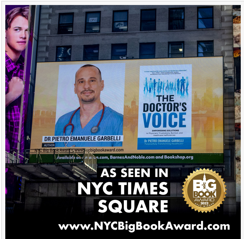
NYC's Times Square Billboard featuring The Doctor's Voice

Publishers included Atmosphere Press, Berrett-Koehler Publishers, Beaufort Books, Beyond Words Publishing, Blackstone Publishing,