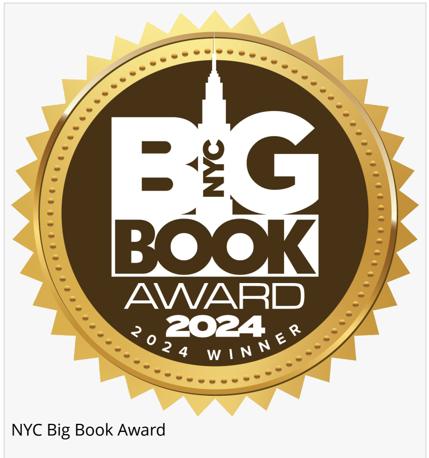
NYC Big Book Award