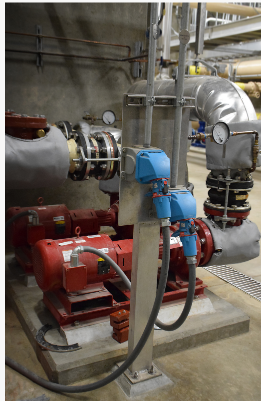
MELTRIC® Electrical Connection on Pump Motor