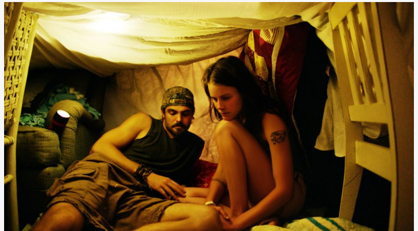
Still from Hazard with stars Alex Roe and Sosie Bacon

This press release can be viewed online at: https://www.einpresswire.com/article/748764427 EIN Presswire's priority is source transparency. We do not allow opaque clients, and our editors try to be careful about weeding out false and misleading content. As a user, if you see something we have missed, please do bring it to our attention. Your help is welcome. EIN Presswire, Everyone's Internet News Presswire™, tries to define some of the boundaries that are reasonable in today's world. Please see our Editorial Guidelines for more information. © 1995-2024 Newsmatics Inc. All Right Reserved.