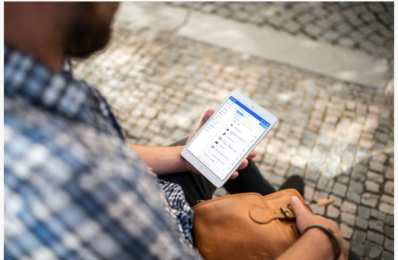
Holzbau Bühlmann AG manages its equipment from anywhere with Timly.

ZURICH, SWITZERLAND, October 3, 2024 /EINPresswire.com/ -- Holzbau Bühlmann AG, a Swiss company specializing in wooden constructions, has integrated the digital solution Timly to revolutionize its material management. Founded in 1933, the company continues to modernize its processes while remaining true to its craftsmanship.