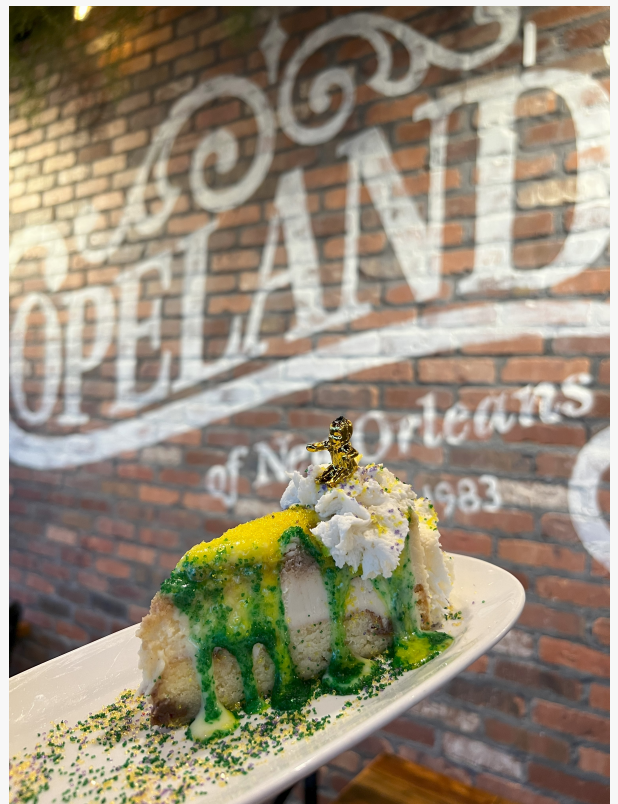
Copeland's of New Orleans Restaurant Desserts.