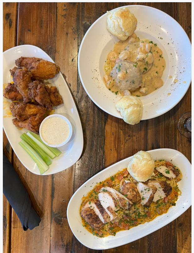
Copeland's of New Orleans Restaurant Food

"Our Cajun Fried Turkeys have become a holiday tradition for many families," added Gabet. "We're honored to be part of our customers' Thanksgiving celebrations and look forward to providing them with an exceptional dining experience, whether in our restaurant or through our holiday offerings."