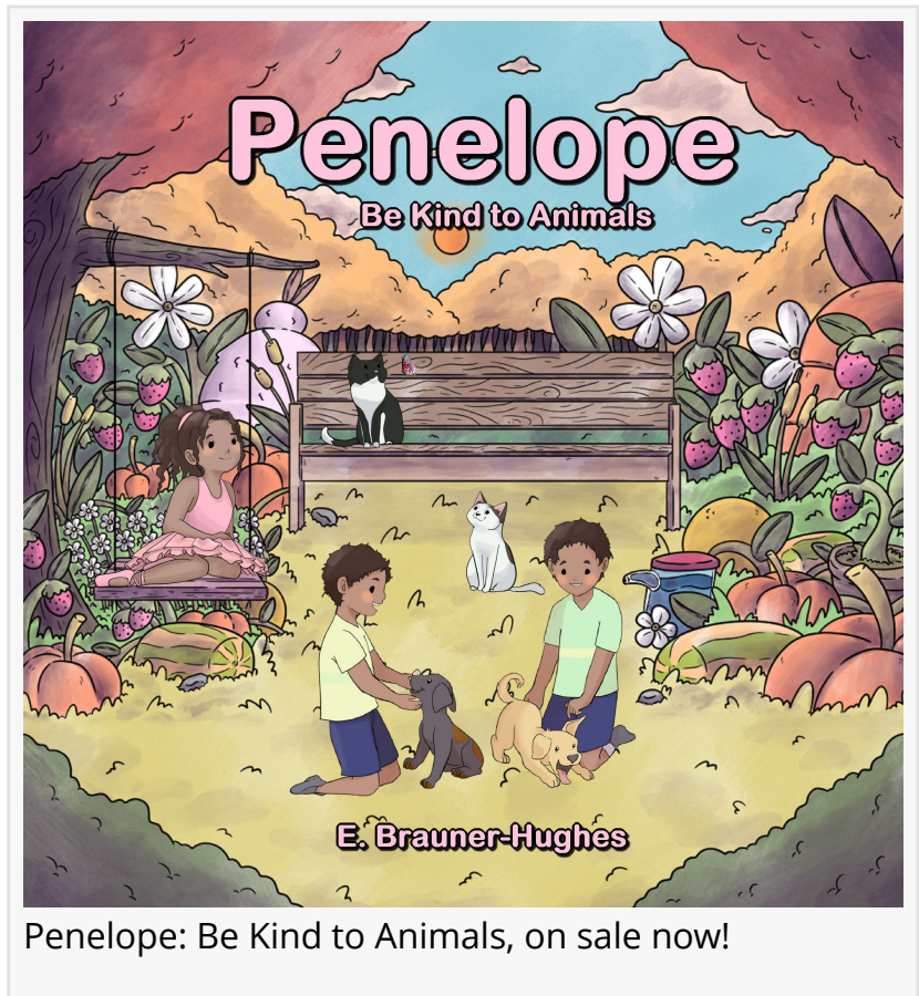
Penelope: Be Kind to Animals, on sale now!

7. A manuscript for a children's book is sometimes only a page long. This page long text can become a 24 page children's book. Especially books for beginner readers, whose attention span may be shorter than a slightly older reader. A young adult book for ages 13 - 18 is usually a chapter book and can range from 24-200 pages.