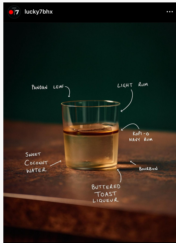
Meet Toast, Lucky 7's best selling cocktail

unique menu that fuses flavours and ingredients from across the region, while maintaining an