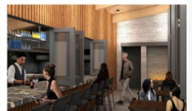
Firebrand Chophouse Roof Deck