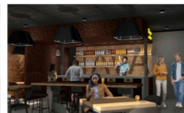
The Tap Room at Tava House Bar