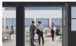
The River Room Banquet Hall