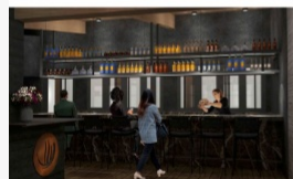
Firebrand Chophouse Bar