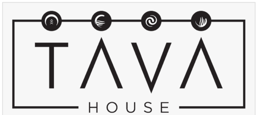
TAVA House logo