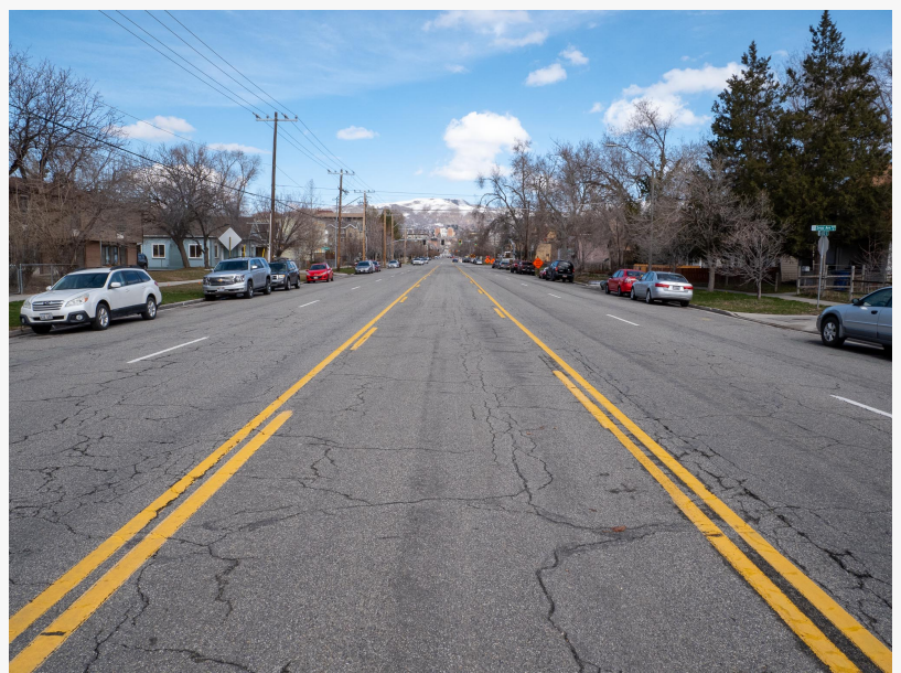
Salt Lake City, Utah - 400 E Street Before

“We are encouraged by the work we’re doing all around the country and are excited to welcome new community partners and city leaders committed to connecting people and building mobility networks around a shared vision,” said Studdard. “We know cities can push past the status quo, make real change and move faster because we’ve seen it. We work with communities to solve common challenges and can’t wait to engage with new cities and provide the resources necessary to get over the finish line.”