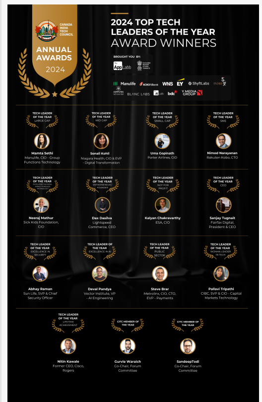
2024 Top Tech Leader of the Year Award Winners by Category