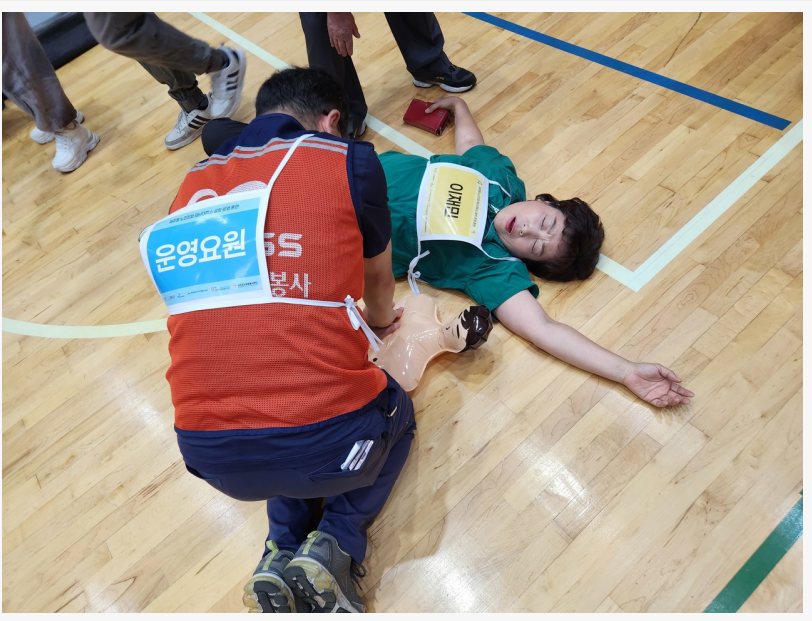
Photo: Operation staff responding to a simulation of an emergency situation (cardiac arrest) in a shelter and a victim who collapsed from cardiac arrest

Volunteers participating in the training played the roles of evacuees and operational staff, responding to a range of unplanned emergency scenarios in an unscripted simulation. Unexpected emergencies, such as