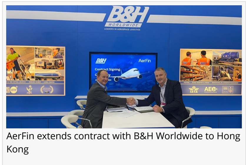
AerFin extends contract with B&H Worldwide to Hong Kong

/Einpresswire.com/ -- B&H Worldwide , the global leader in aerospace and aviation logistics, is pleased to announce the expansion of its agreement with aviation asset specialist AerFin , which buys, sells, leases and repairs aircraft, engines and parts to maximise value for owners and provides a lower-cost supply of material to its airline, lessor and MRO customers.