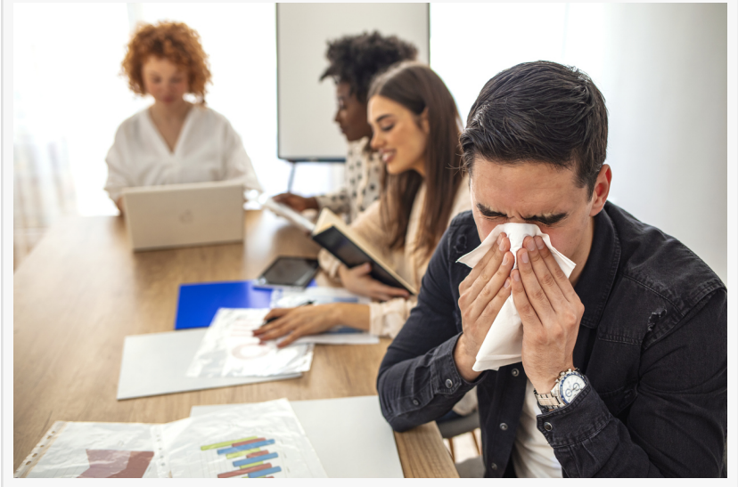
office cleaning mississauga

Cleaning physically removes dirt, dust, and germs from surfaces, but it doesn't necessarily kill them. Disinfecting, however, uses chemicals to kill germs, preventing their spread. Furthermore, sanitizing reduces the number of germs to a level considered safe by public health standards. If you're looking for a commercial cleaning service in Brampton that has mastered all three,