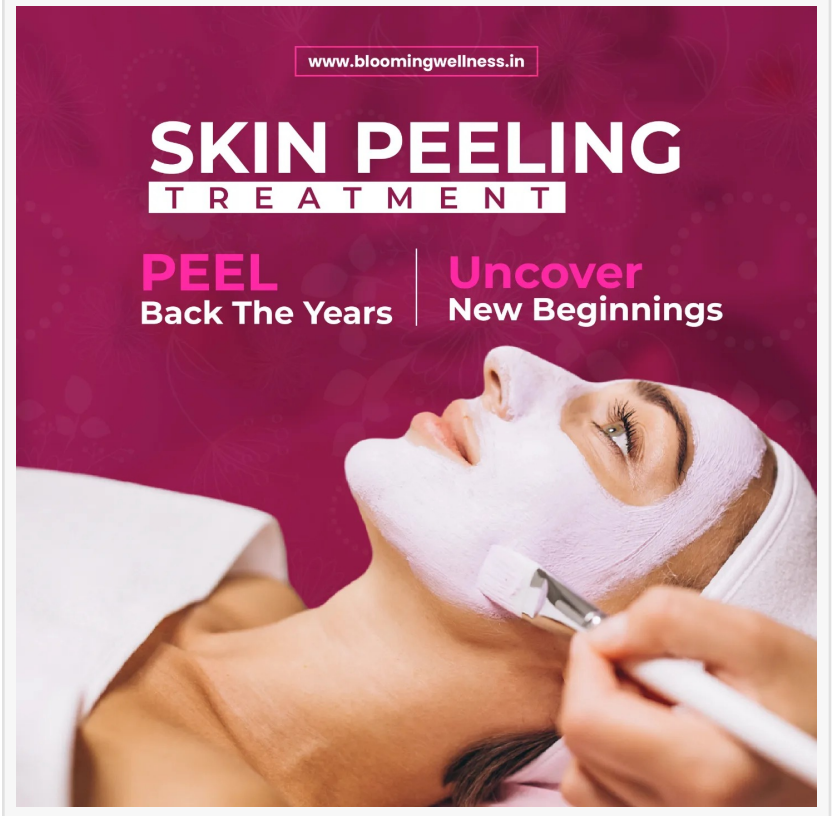
Renew, Revitalize, and Restore Your Skin with Our Safe Peeling Procedures