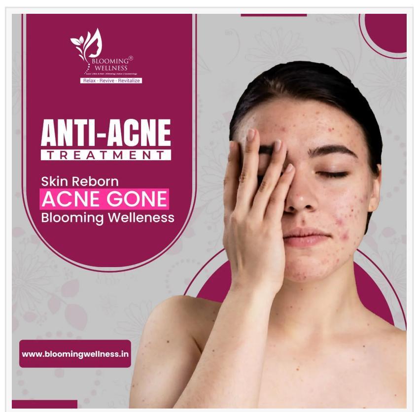
ay Goodbye to Breakouts! Experience Tailored Anti-Acne Solutions at Blooming Wellness.

Lipo-Dissolve: One of the safest, most popular, and most successful non-surgical weight loss treatments focus on a particular area for fat loss and spot reduction requirements without leaving unwanted scars or side effects.