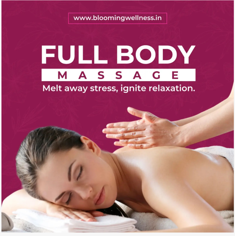
Where Relaxation Meets Rejuvenation