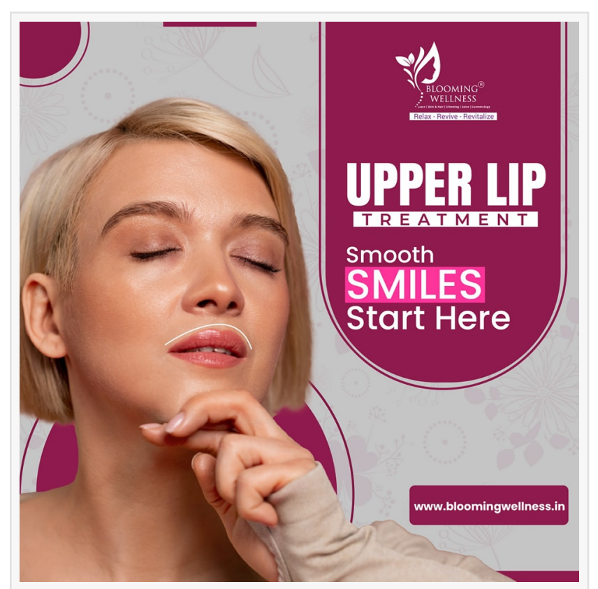
Be Bold, Be Beautiful—Perfect Your Upper Lip Today

Blooming Wellness beauty services are designed to align with the individual's wellness goals. From slimming treatments to non-surgical facelifts, the range of services ensures that clients experience a comprehensive transformation that not only focuses on their physical health but also boosts their self-esteem and confidence.