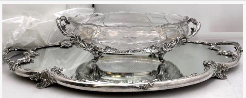
Cardeilhac French sterling silver mirrored plateau and centerpiece bowl in the rococo style, 0.950 (a higher purity than sterling), weighing 55.6 troy oz. (est. $12,000-$15,000).

https://www.liveauctioneers.com/catalog/344350_estate-silverware-toys-decor-glass-art/ .