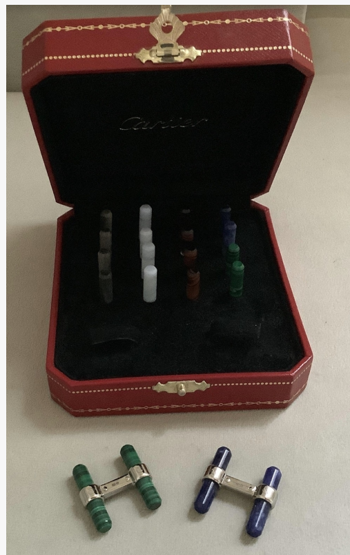
Set of Cartier gemstone gold interchangeable bar cufflinks in malachite, lapis and more, with the original box (est. $4,000-$7,500).

Decorative accessories will feature a Steuben Glass Co. blue aurene signed bud vase marked on the bottom #2556, 6 inches tall (est. $500-$950); a limited-edition 1990s Lalique satin-finished crystal shark, 3 ¼ inches long, created exclusively for Nassau Bottle (est. $500-$750); and a Herend signed fishnet