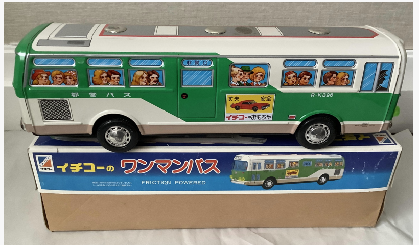
Vintage Japanese friction bus by Ichiko, approximately 16 inches long, with original box (est. $200-$500).