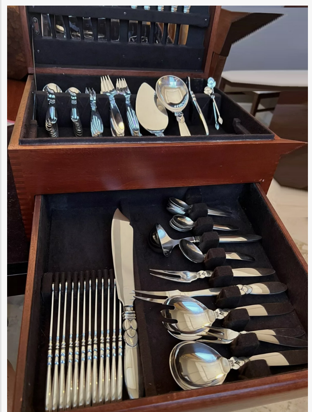
115-piece Georg Jensen sterling silver flatware serving set service for 12 + 19 in the Denmark Cactus pattern, being sold without a storage case (est. $14,000-$16,000).

Other jewelry offerings will feature a pair of Italian-made Gianmaria Buccellati sterling silver cufflinks with red jasper at the center in a beautiful floral motif (est. $450-$650); a Tiffany & Co. signed sterling silver with blue enamel ice skate charm necklace, 16 inches long (est. $400-$600); and a Gucci dog collar with charm made in Italy with paper bag and box (est. $300-$450).