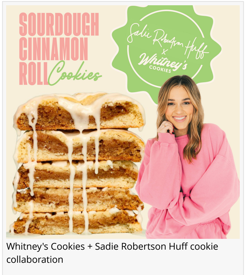
Whitney's Cookies + Sadie Robertson Huff cookie collaboration

This limited-release cookie box contains four or six of Sadie's Sourdough Cinnamon Roll Cookies . Available for a limited time, a portion of the proceeds from each cookie box will go to support Camp Ch-Yo-Ca .