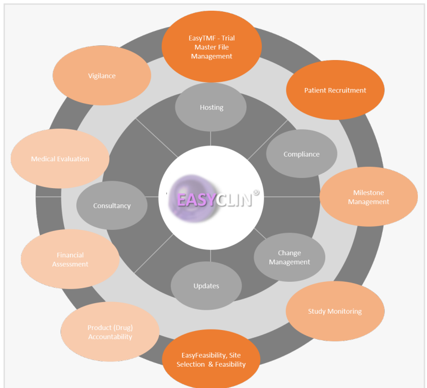
The EasyCLIN® Diagram