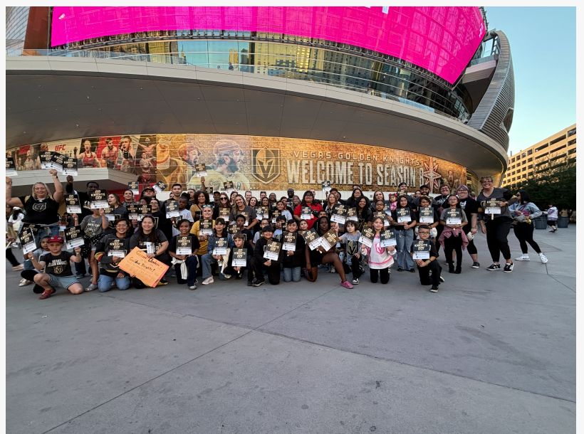
Cozine Elementary School Arrives at Vegas Golden Knights Game, Oct 3, 2024