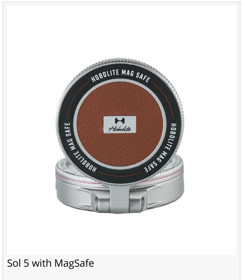
Sol 5 with MagSafe

Both models come with a soft pouch for easy transport and a USB Type-C charging cable for quick and convenient power-ups, making the Sol 5 a perfect portable solution for creators on the go.