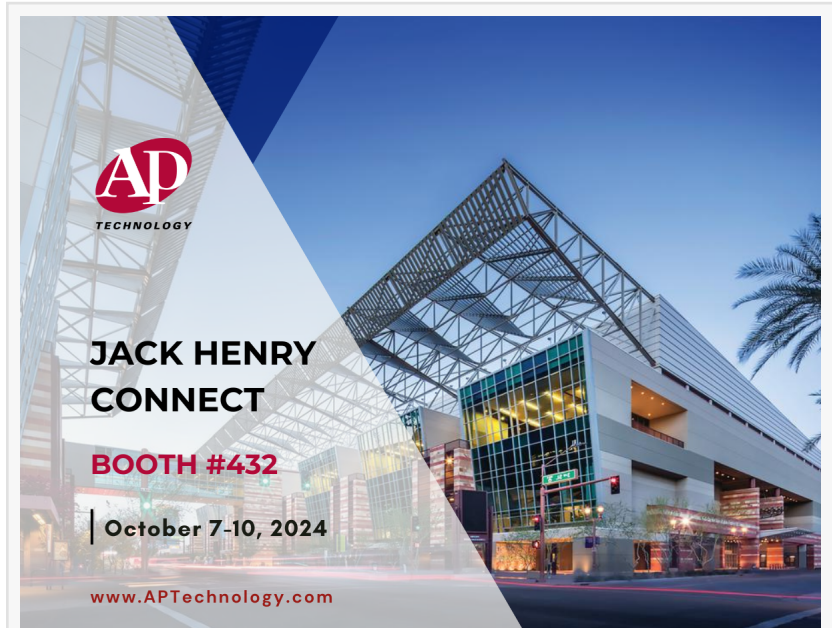
AP Technology Brings Its Flexible Remote Check Processing and Printing Solution to Banks and Credit Unions at Jack Henry Connect 2024

One of the standout features of the APSecure system is its configurable internal workflow controls, enabling financial institutions to securely extend cashier check processing capabilities to customers, wherever they are. By integrating seamlessly into existing core systems, the