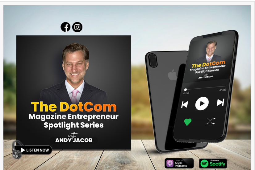
The DotCom Magazine Entrepreneur Spotlight Series-Cover Story