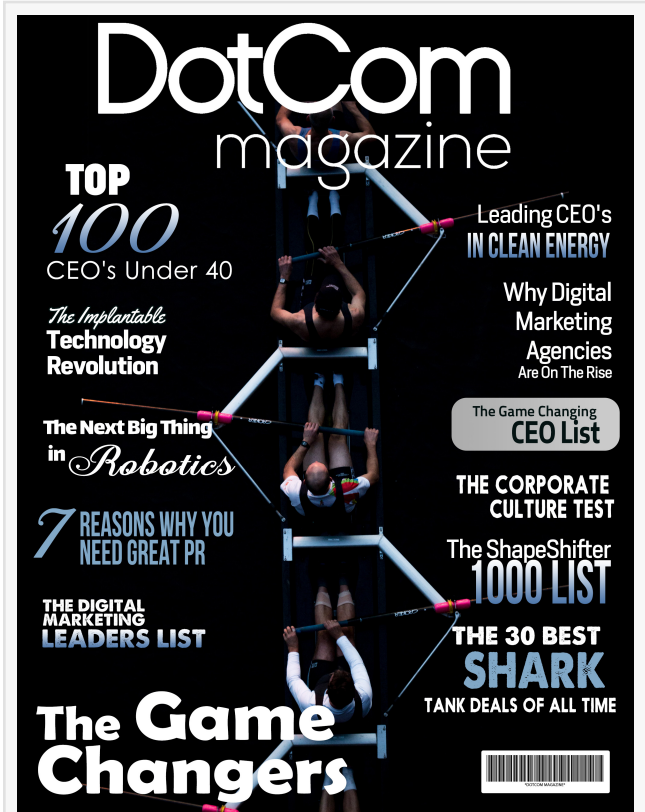
The DotCom Magazine Game Changers Edition

DotCom Magazine is a leading news platform providing fascinating interviews with news makers, thought leaders, and entrepreneurs. DotCom Magazine is the leader in putting people with insatiable entrepreneurial spirit at the forefront of every story it covers. The Entrepreneur Spotlight Interview Video Series looks at business through the lens of a successful entrepreneur’s mindset. The Entrepreneur Spotlight Series has included high-profile leaders, including Inc 500 founders, Ted Talk presenters, ABC Shark Tank participants, venture backed visionaries, prolific CEO’s and Founders, and many other wonderful thought leaders and entrepreneurs. DotCom Magazine covers Founders and CEO’s making a difference. Regardless of who the entrepreneur is, where they live, or what they are doing, if it is interesting and newsworthy, DotCom Magazine covers it. In selecting entrepreneurs for this important video series, we consider the newsworthiness of the story and what our viewers want to learn about. If something is important to our viewers, it is important to DotCom Magazine. The people at DotCom Magazine believe in including a diverse