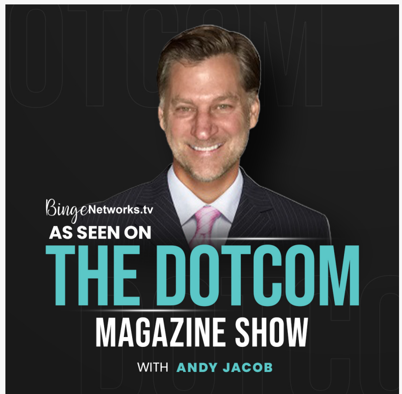
The DotCom Magazine Entrepreneur Spotlight Series-Featured Interview