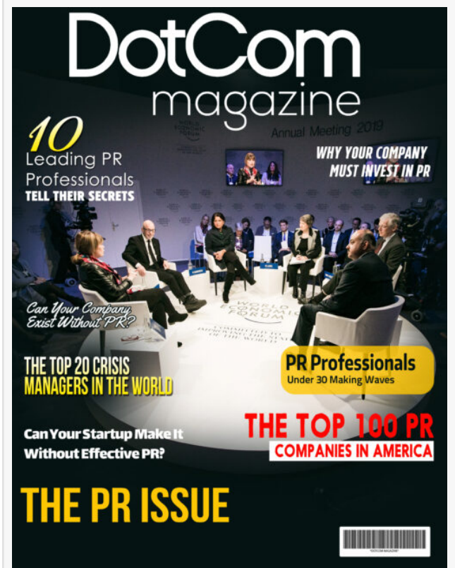
The DotCom Magazine PR Issue