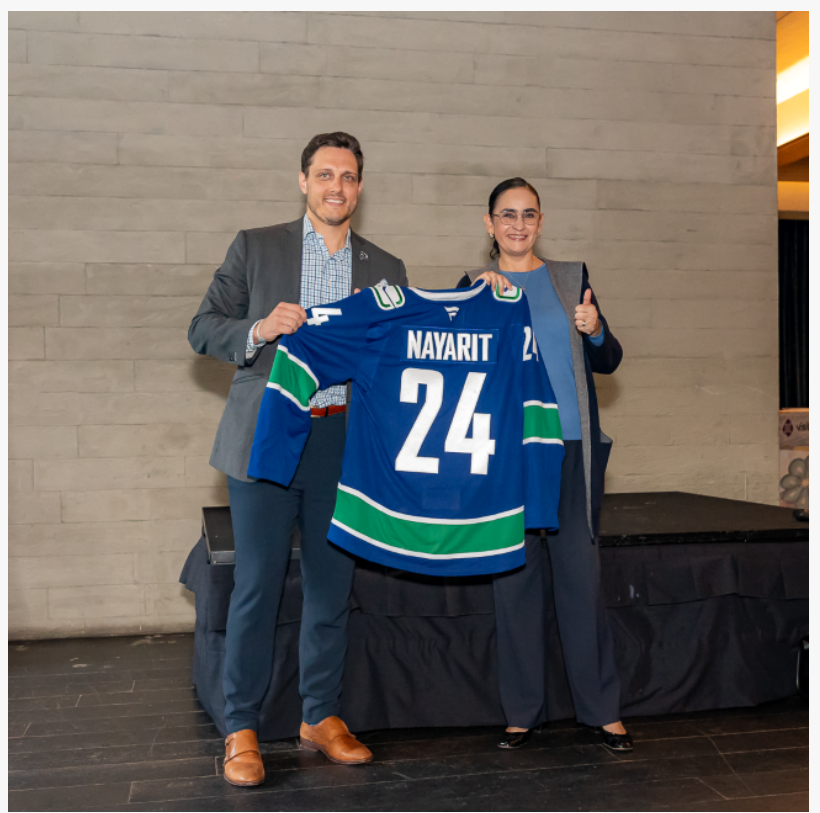
The state is now the official Mexican Tourism Destination of the Vancouver Canucks

Riviera Nayarit, with 192 miles of coastline, is home to the colonial city of San Blas, whose 16th-century San Basilio Fort once protected the area from pirates. Just to the south are the surf-friendly beaches of Matanchén