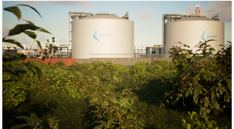
Argent LNG GTT Tanks 2