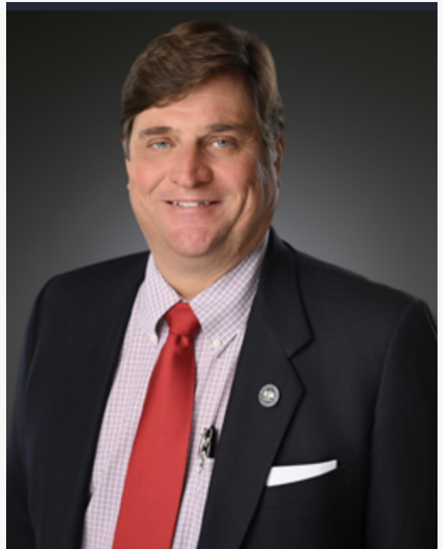
State Representative Joseph A. Orgeron

As the project progresses, it promises to create jobs, stimulate local economic growth, and fortify Louisiana's role in the global energy landscape.